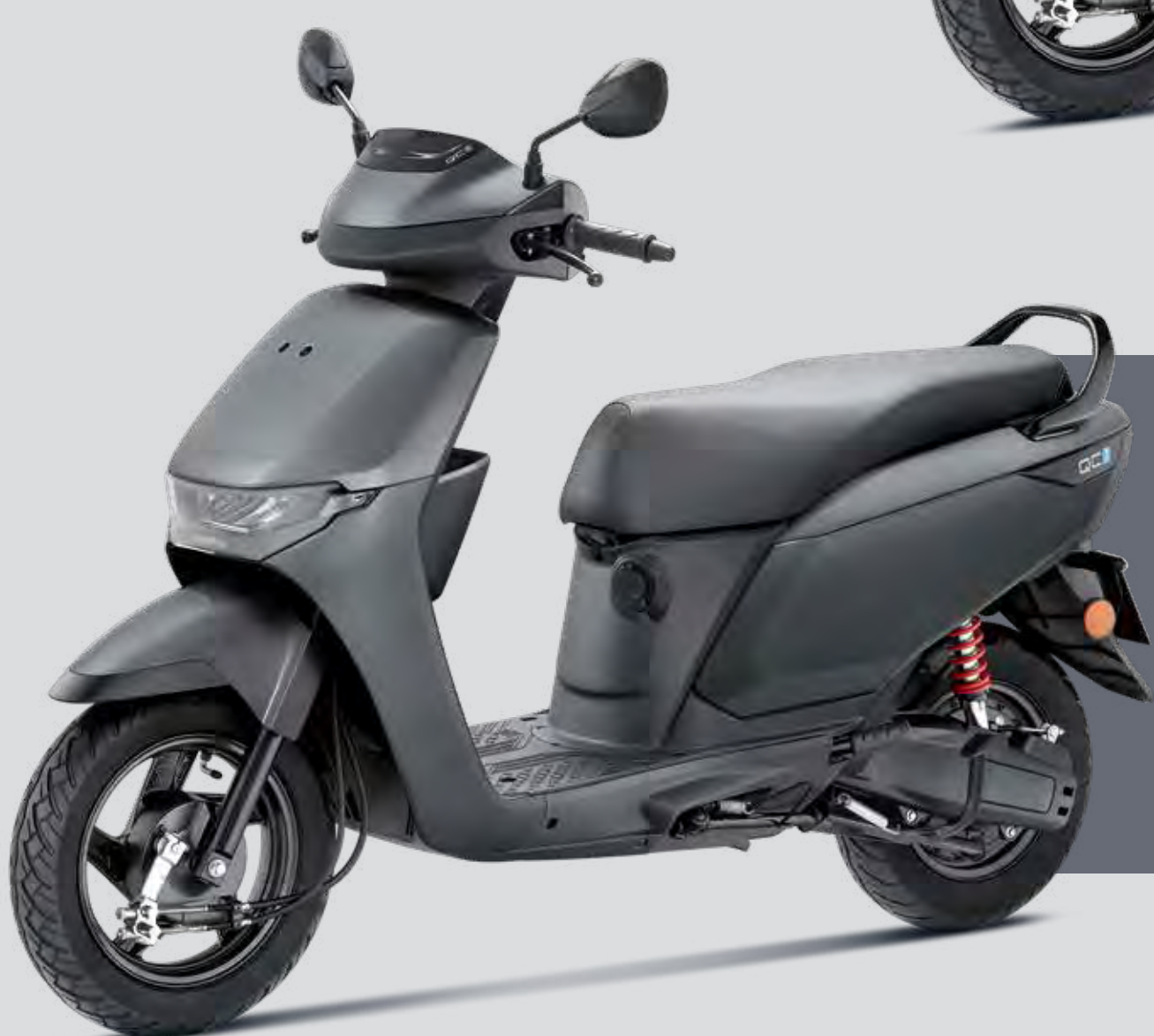
Matt Foggy Silver Metallic

*Products shown in the pictures may vary from actual products available in the market. All features and colours may not be a part of all variants. Accessories shown in the pictures are not a part of standard equipment. For creative visualisation only.